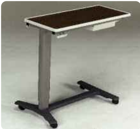
Standard Overbed Table Available with Standard or Low Base (OBT210)