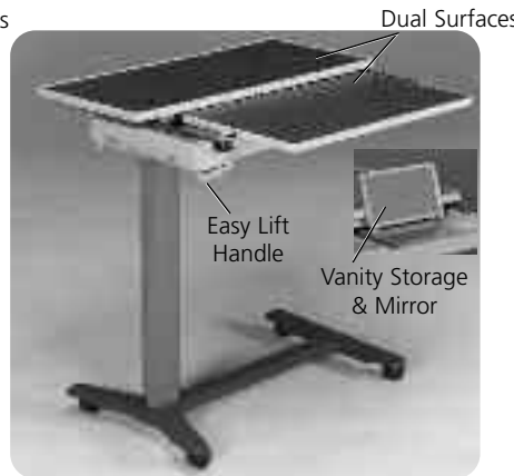
PatientMate® Jr. Overbed Table