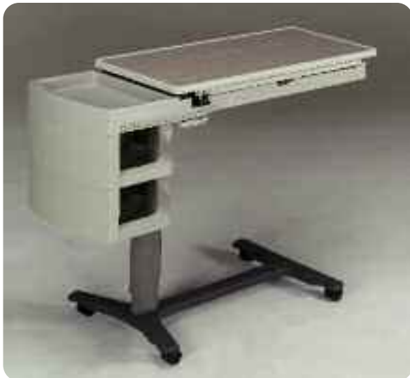
PatientMate® Overbed Table with storage compartment Available with Standard or Low Base (OBT230)