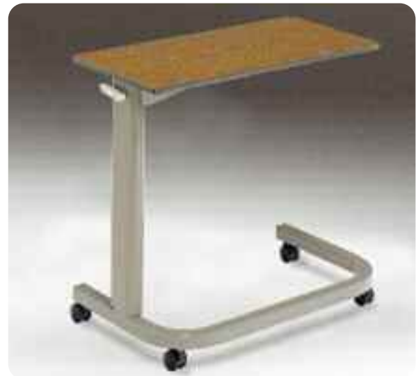
C-base Overbed Table (OBT100)