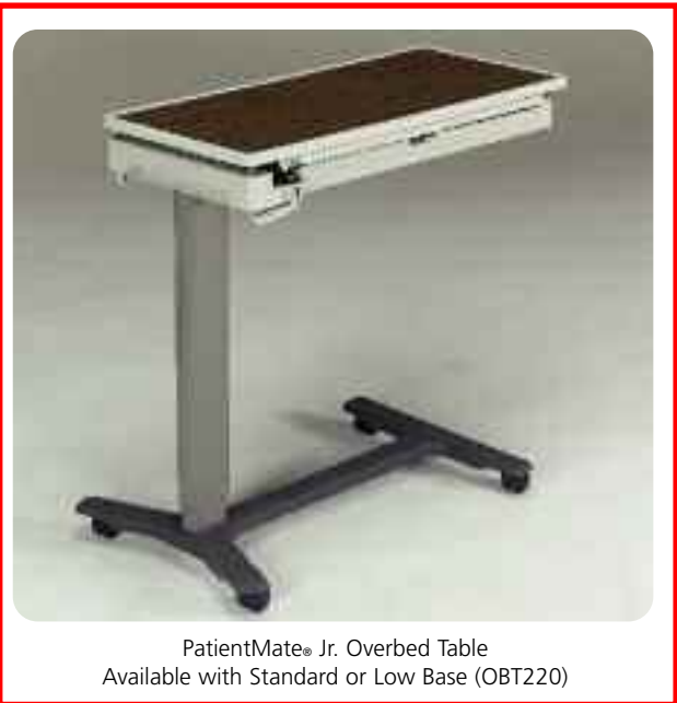
PatientMate® Jr. Overbed Table Available with Standard or Low Base (OBT220)